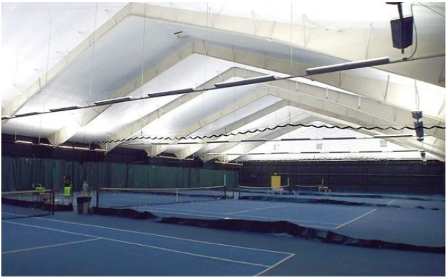
Waltham Athletic Club, MA Before (Top) / After (Bottom)