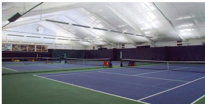
The Natick Racquet Club, MA Before (Top) / After (Bottom)